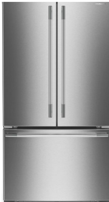
KRFF436SPS STD DEPTH