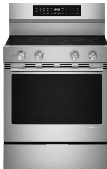
KFES530SPS- ELECTRIC FREE STAND